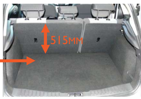
FRONT PANEL HEIGHT = 515mm (measure along seat surface)

Room for space saver spare tire under the floor