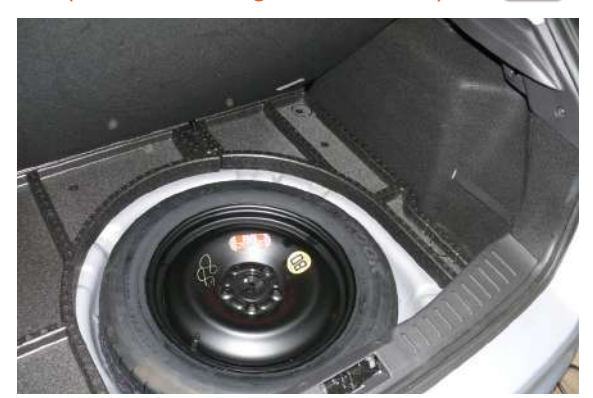
Shallow support frame