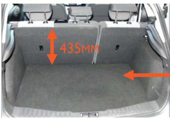
FRONT PANEL HEIGHT = 435mm (measure along seat surface)

Room for Full size spare tire under the floor