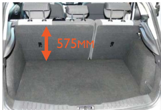
FRONT PANEL HEIGHT = 575mm (measure along seat surface)

No room for full size or space saver spare tire under the floor