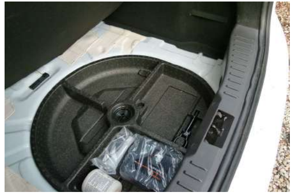
No support frame, and removable shallow storage insert