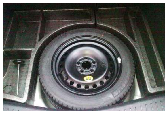
Deep support frame