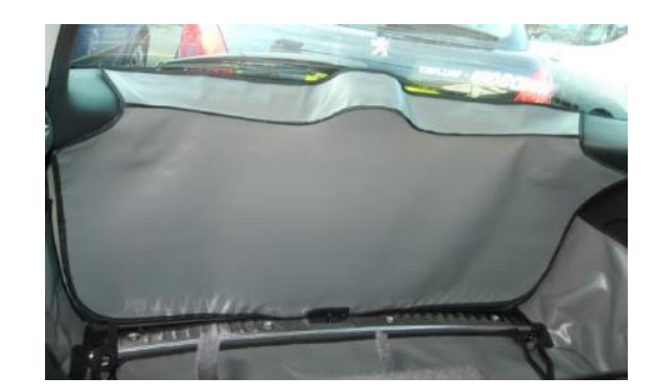
liftgate cover (generic photograph)

Use the self-adhesive loop fastener tabs to attach the cover to only the plastic trim area.